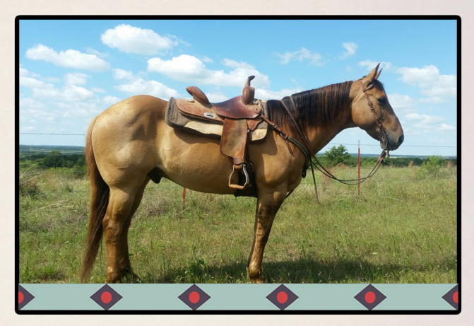
CLICK HERE FOR VIDEO

Cody is a Red Dun gelding with a lot of shape! If you need a good horse to go do a job, Cody is for you! This gelding is super willing, has a nice handle and easy stop. He has been used around cattle and is great to go check your herd and fences. He has a nice free moving walk with a smooth trot and lope. No buck, spook or silliness about him. This is a great all around using horse whether you want to cowboy on him or just trail ride. Cody has all the right tools and is easy on the eyes! This neat gelding stands 15 hands.