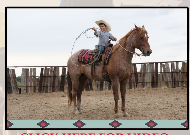
CLICK HERE FOR VIDEO

Affectionately known as Phoenix, this well built gelding has been used for ranch work, sorting and turning back. He's also experienced in colt starting, ranch rodeo and is great on the trails. He has a willing attitude and is eager to please. This is a very nice, sound gelding who has been used by all ages for trail riding.