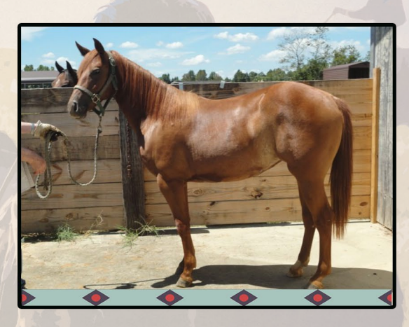
CLICK HERE FOR VIDEO

Affectionately known as 'Pumpkin', this mare is one of the nicest fillies her owners have ever raised. This filly has been gently started and is coming along nicely. The sky's the limit with this mare. You can take her in any direction! Her breeding is top notch and will enable her to excel in any discipline. The Merada mares on her bottom side speak for themselves. Her sire Catty Hawk by High Brow Cat is one of the top cutting horse sires today. Catty Hawk's offspring have earned over 565,000 in the cutting pen. The sire himself is an earner of over 240,000! This nice mare stands 14.1.