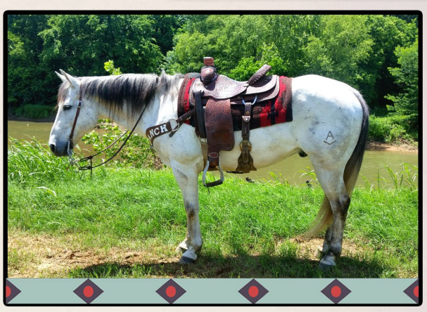
CLICK HERE FOR VIDEO

King is a gorgeous grey gelding with a dark mane and tail. He is heavy boned, and has a big, black, soft eye. He is an excellent head and heel horse who has won money at many jackpots and USTRC ropings. King is gentle with great ground manners, is easy to catch, bath and shoe. Easy keeper and gets along great with other horses. This gelding is really broke and you can use him to sort cattle or go rope one in the pasture. He would work for a first time horse owner or a seasoned veteran. He also breakaway ropes and you can shoot guns off his back. All the hard work is done. You will spend a lot of time looking for a gelding as nice as King! This nice gelding stands 15.1 hands.