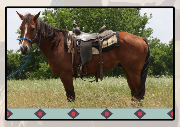
CLICK HERE FOR VIDEO

Sunny' is a nice athletic gelding that has been used in all aspects of ranch work including doctoring, gathering, sorting and shipping. This gelding has been started on the heel side and breakaway roping; he is coming along nicely. He has also been used on many trail rides. This neat gelding has a very willing attitude and is eager to please. He is sound and ready to go!