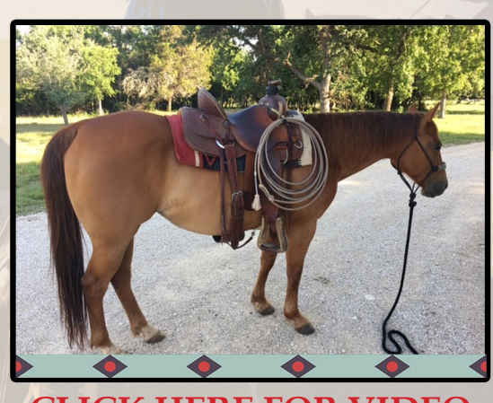
CLICK HERE FOR VIDEO

Gypsy is a very nice cutting bred mare. Originally used to cut, she has been used to run barrels, poles and goat tie. She has worked cattle in the brush and is great at penning and sorting. She has not been roped off of but has had a rope swung on her and drug. This nice mare is very sweet and smart but not for an unexperienced rider. The family's children ride and run her in barrels and poles. Gypsy has awesome bloodlines with Doc O'Lena on the top and Doc's Prescription on the bottom. She is sound and 13.2 hands tall.