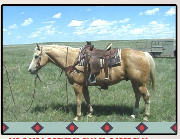
CLICK HERE FOR VIDEC

Take a look at this beautiful Palomino gelding. This guy has had thousands of cattle worked on him from doctoring in pastures to sorting pairs. He loves to be ridden! He is a been there done that kind of horse. Gentle as the day is long. Once while driving pairs, Dude was taking the day off in the pasture but decided to trot up and drive cattle as if he had a rider. He's a true gentleman. He has a little age on him so he's a bit slow...but if you want an nice gentle, good-looking gelding, he's your guy! Dude stands 15 hands.