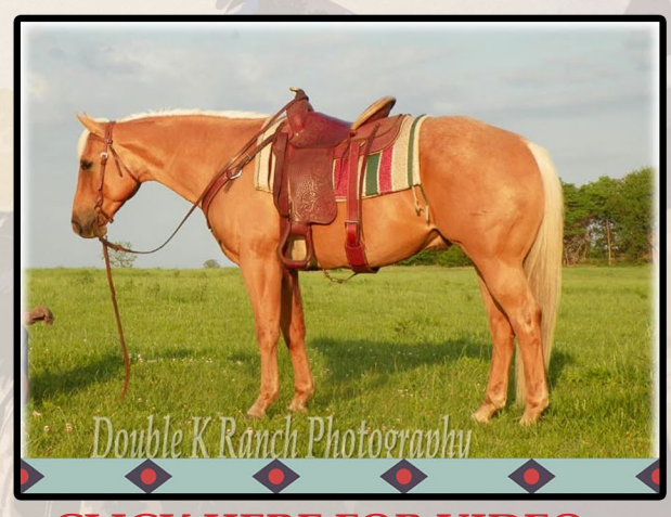
CLICK HERE FOR VIDEO

Steady, calm and quiet. Neck reins, backs, sidepass to open gates, takes both leads. Rides bareback with a halter or just a rope around his neck. Safe for anyone, he's a do anything, go anywhere, unflappable, gem of a guy. Rode in the local parade this spring. Crosses logs, water and bridges. Great in rough country or open. Traffic safe, been into town many times. Moved cows, worked a lot of horses in the round pen and ponied colts. Pulls off the horn and you can swing a rope off of him. Durango is easy to mount but stout enough to carry any size person. His owner has hauled home a long, small tree off the side of him bareback....it never rattled his composure. Golden inside and out! Saddle up and ride off any time and be completely safe. His original owner trained him from the ground up, he has always been that way. Great gound manners, he doesn't even need to be tied up when being saddled or having his feet worked on. Hobbles, stump mount, great in trailers and around other horses. No buck or bad habits. Sound. For more video/photos see www.dblkranch.com. This nice gelding stands 14.3 hands.