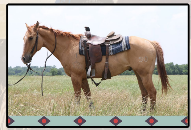
HERE FOR VIDEO

Gold Rush is a reliable and gentle gelding that came from the Texas prison system. He has been used in all aspects of ranch work, doctoring yearlings, shipping, sorting and roping. This gelding has been started on the head and heel sides and has been hauled to church jackpots. He has also been used for foxhunting and trail riding. This gelding has a very willing attitude. He will go and do anything you ask of him. Gold Rush is broke for all ages. This gelding stays sound and sane. He would make a great addition to any family.