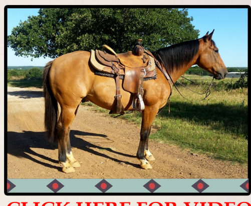
CLICK HERE FOR VIDEO

Buster is an 8 year old dun gelding with a thick, dark dorsal stripe, black legs and 4 white socks! This is the easiest keeping horse the owner has ever had. He hasn't eaten a full bag of grain in a year! Just kick him out and he stays fat on practically nothing! If you are looking for a nice, quiet trail mount or something to go check fences, Buster is for you. If you are looking to get somewhere in a hurry, you better buy something different! Buster is happy to ease along at a slow pace. He does have a nice trot and smooth lope, will work when asked, but is happiest walking along the trail or gathering cattle. He has been used around cattle here on the ranch and has been trail rode in the mountains. He is never spooky or looky, he just goes where you point him. Rides the best in an 0-ring snaffle! Buster is very well mannered on the ground. Easy to trim, bathe, load and haul. Buster stands 15.1 hands.