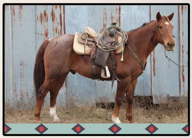
CLICK HERE FOR VIDEO

Four Dee Roan was bred, raised and used on the legendary Haythorn Land & Cattle Co. Purchased as a 7-yr-old, this nice gelding is easy to catch, shoe, load and bathe. He is excellent in all phases of ranch work...penning, sorting, loading, doctoring and tagging calves. He can catch a wild cow and drag calves. This gelding has a lot of get up and go to do his job and would not be considered a kid horse. If not ridden regularly or thoroughly warmed up, he can be a bit cold backed. His 67-yr-old owner gets along great with him! 4D is a good trail horse; he has been on several 2-3 day trail rides. This nice gelding is a good head horse and has been in many ranch rodeos. This nice gelding stands 15.2 hands and weighs in at 1250.